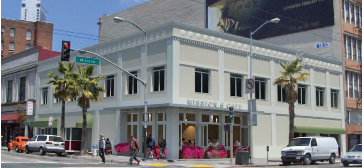
Potential Restaurant Design, Rendering by HKS™